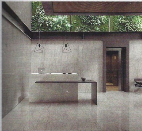
Del Conca USA: Boutique Porcelain Tiles delconcausa.com Boutique is an elegant interpretation of marble offered in six styles. Available in five size options that include large-format slabs and outdoor pavers, these tiles allow for aesthetic continuity throughout an entire space.