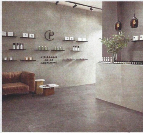
Supergres: Epika Porcelain Stoneware supergres.com These porcelain stoneware tiles feature a soft, subtle graphic pattern that resembles the natural veining and fossil inclusions typical of limestone. Available in wall and floor tiles, the range includes five colors and four standard sizes.