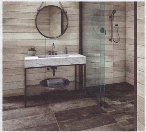
Crossville: Reformation Porcelain Tile crossvilleinc.com The Reformation collection is offered in four warm-to-cool hues and includes three large-format plank tile sizes, two mosaic options, and a trim package, offering versatility for custom looks on floors and walls in commercial settings.