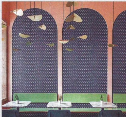
Appiani: Denim Mosaic Collection appianimosaic.com Designed to resemble denim fabric, this collection features a textured matte surface and anti-slip properties. Three patterns—Striato, Ondulato, and Sfilato—are available in two different variants.