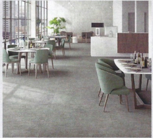
Century Ceramica: Glam Ceramic Tiles century-ceramica.it Inspired by natural stones and cement, Glam offers richness in detail and an elegant color scheme. It is available in five colors—Beige, Bianco, Grigio, Tortora, and Antracite—and a wide range of formats.