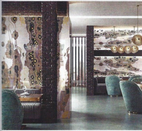
Sicis: Vetra Gem Glass sicis.com A combination of special techniques and processes results in glass sheets that capture the beauty of 13 different precious stones and lava rocks with many different effects, including translucent, metallic, opaque, and satin.