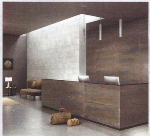
Naxos: Academy Porcelain Tiles naxos-ceramica.it Inspired by aging metal, Academy is chromatically minimal, focusing on white, gray, and black tones across a nine-color range. The wall tiles come in two standard sizes, while the floor tiles are available in one format.